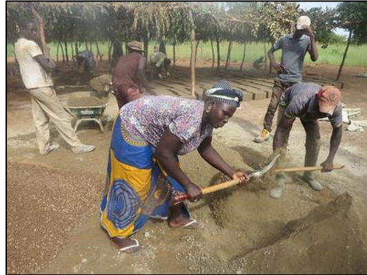
Construction of School in Berela, Mali

Ground breaking for schools in Djelenfing and Magadala, Mali as well as Khuza, Malawi all took place recently.