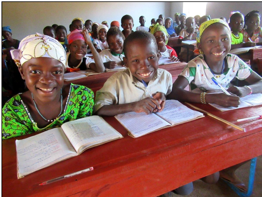
Students in Barela, Mali

Our school in Berela, Mali is now complete. Local governments have closed schools in Mali. However 120 students (21 boys and 99 girls) will be attending classes again as soon as it is safe.