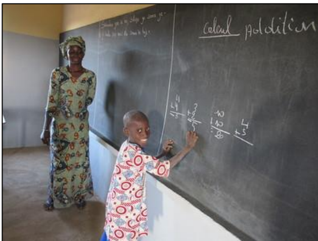
Student and Teacher in Berela, Mali

Thanks to your wonderful 2019 year end donations we have three schools under construction and one school recently completed.