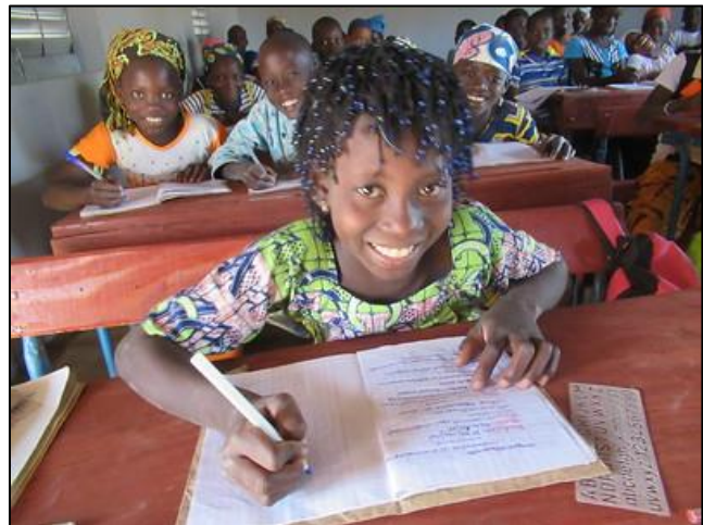
Students in Berela, Mali

Our partner NGO in Africa, buildOn reports that their in-country staff will continue to build our schools as long as it is safe. There are very few confirmed cases of coronavirus in Mali and no confirmed cases in Malawi to date, but we know this will change. To protect their team and the communities, they are refraining from holding mass meetings and are limiting the number of people on any worksite to ten. Hygiene protocols have increased and they will not hesitate to shut down a worksite if the situation in each country worsens.