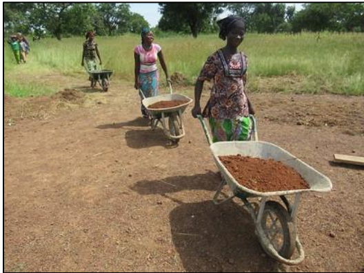
Construction of School in Berela, Mali